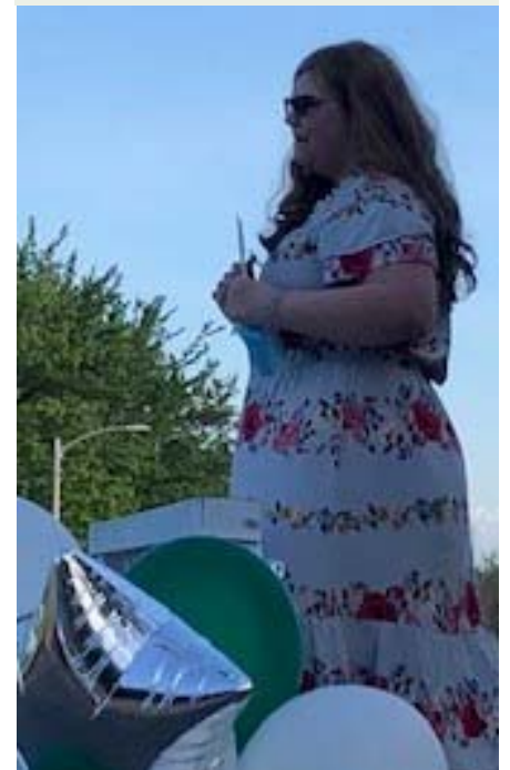
Speakers presented in an outdoor ceremony at the Middle School's 8th grade drive through celebration for students now moving on to the High School.