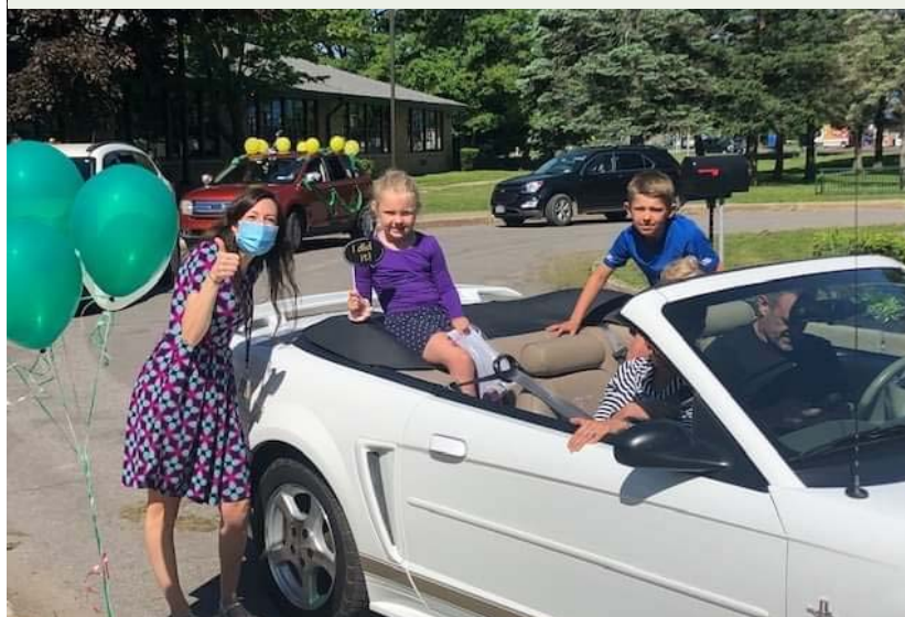
Highland families and staff enjoyed drive through events celebration students moving up from Kindergarten to 1st grade and 5th graders to the Middle School this Fall.